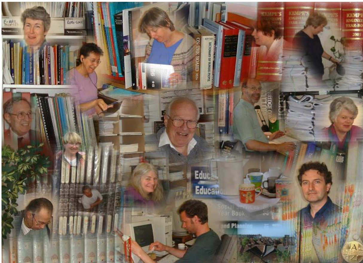
Indexing Specialists, the team at work